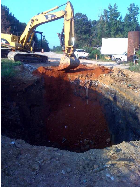
Excavation of the right-of-way along Highway 25