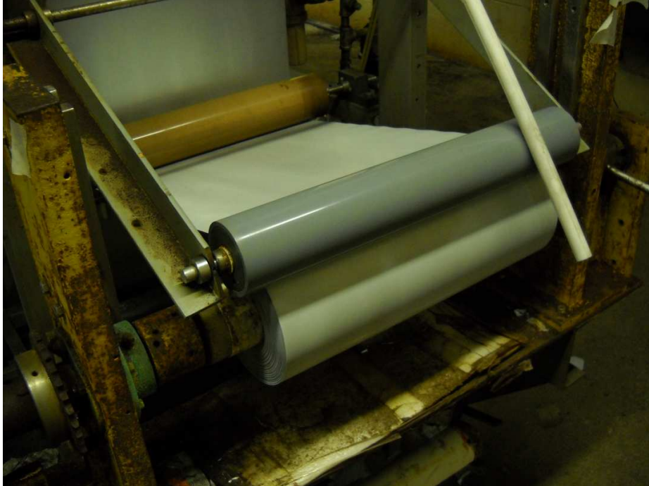
Aluminum foil rolls in etching machine