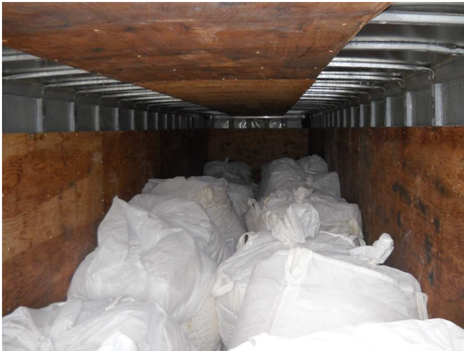
Sacks of borate material found inside tractor trailers

In November 2010, Assessment Section personnel traveled to the site to meet with a representative of the property owner and to evaluate the trailers and their contents. The trailers were found to contain large fiberglass bags filled with a white, powdery material. ADEM collected samples from one of the bags and took photographs of the trailers and their contents; information from paperwork boxes on the trailers was also obtained during the investigation. Sample analysis revealed that the material contained borate; further research indicated that the material was a non-hazardous, borate-based insecticide and fungicide. In February 2011, Assessment Section personnel returned to the site to meet with the individual responsible for the trailers. The responsible party agreed to refurbish the trailers and remove them from the property. At this time, ADEM is coordinating with the property owner and the responsible party to ensure that the trailers are removed from the site and the material is disposed of properly.