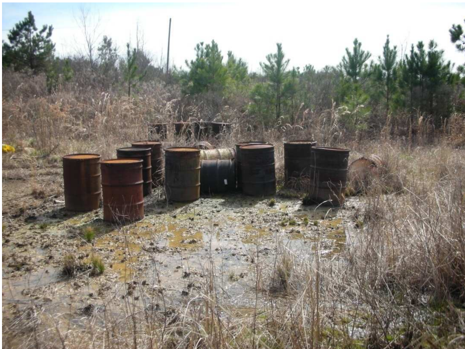
Abandoned drums, prior to removal by unknown party