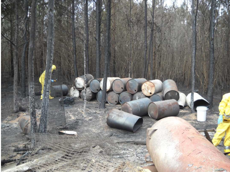
EPA response personnel recording inventory of drums found on-site