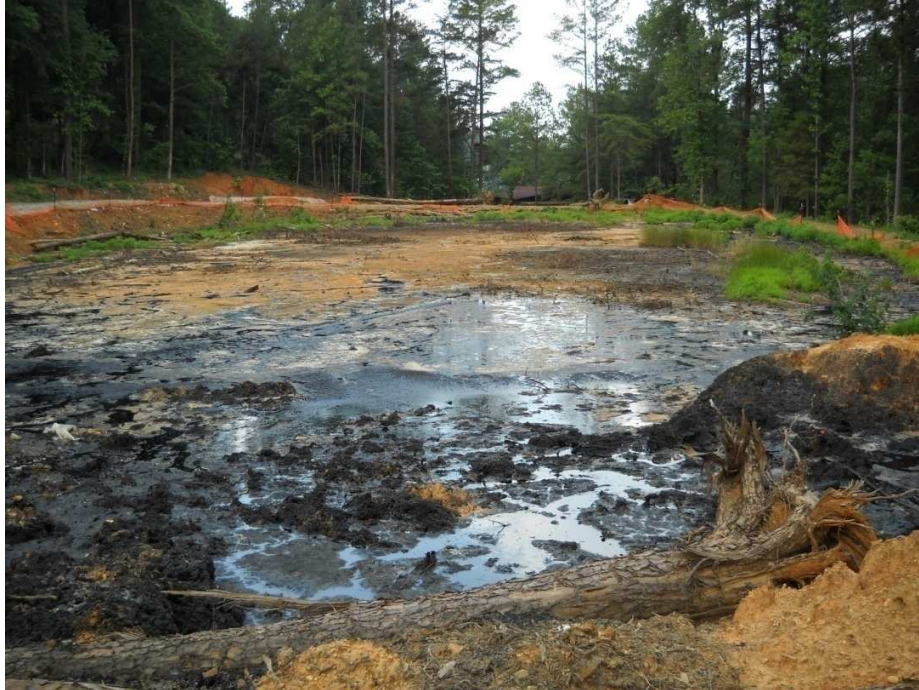
Main lagoon containing tall oils and asphalt-related waste