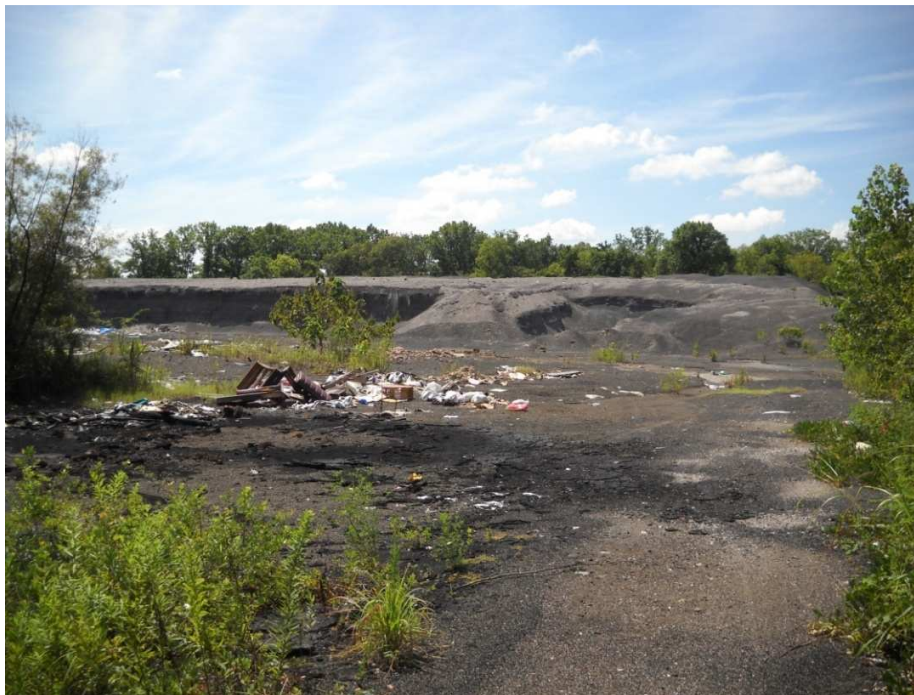
Fluff pile discovered in clearing near 41 st Avenue

In August 2011, Assessment Section and Industrial Hazardous Waste personnel inspected the site and collected samples of the material for analysis. At the site, investigators discovered a large pile of material measuring about 30 feet high, 350 feet long, and 200 feet wide. The pile appeared to be plastic and rubber fluff material from an automobile shredder, as well as a white, friable material that had been deposited in a distinctly separate area of the pile. ADEM personnel collected samples of the two different types of materials. Laboratory results later revealed the presence of lead below regulatory limits. In November 2011, personnel from ADEM's Industrial Hazardous Waste Branch met with representatives from JK Holdings to conduct further sampling. The results of this sampling event indicated that the material in the pile is non-hazardous. The site was referred to ADEM's Solid Waste Branch for further action. At this time, there are no further actions planned under the AHSCF program.