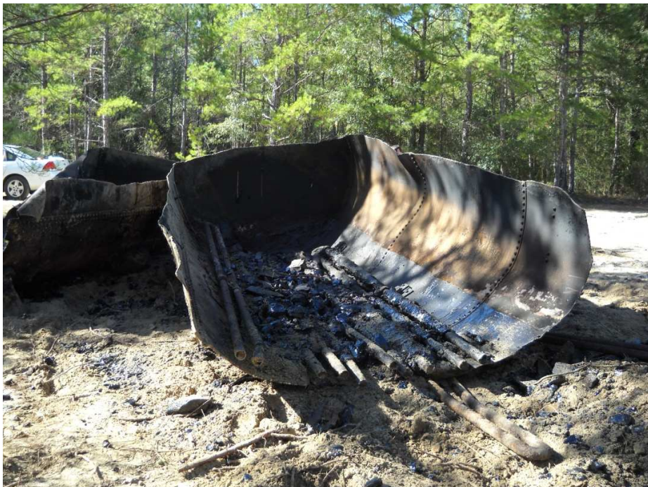
Dismantled tank found on adjacent property