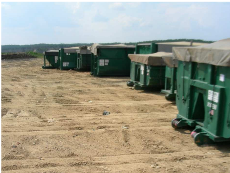
Roll-offs containing hazardous soil, staged for transport to Emelle