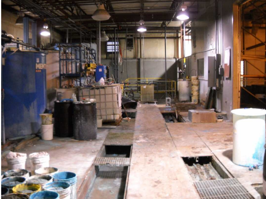
Wastewater treatment area, with containers of hazardous wastes