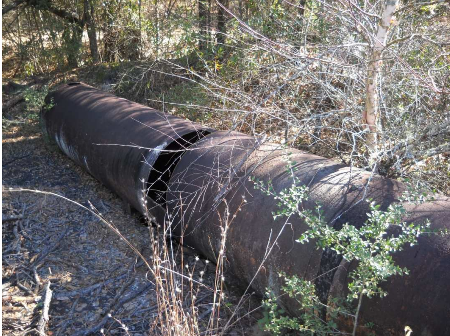
Tanks and tar collection pit found near abandoned fuel depot