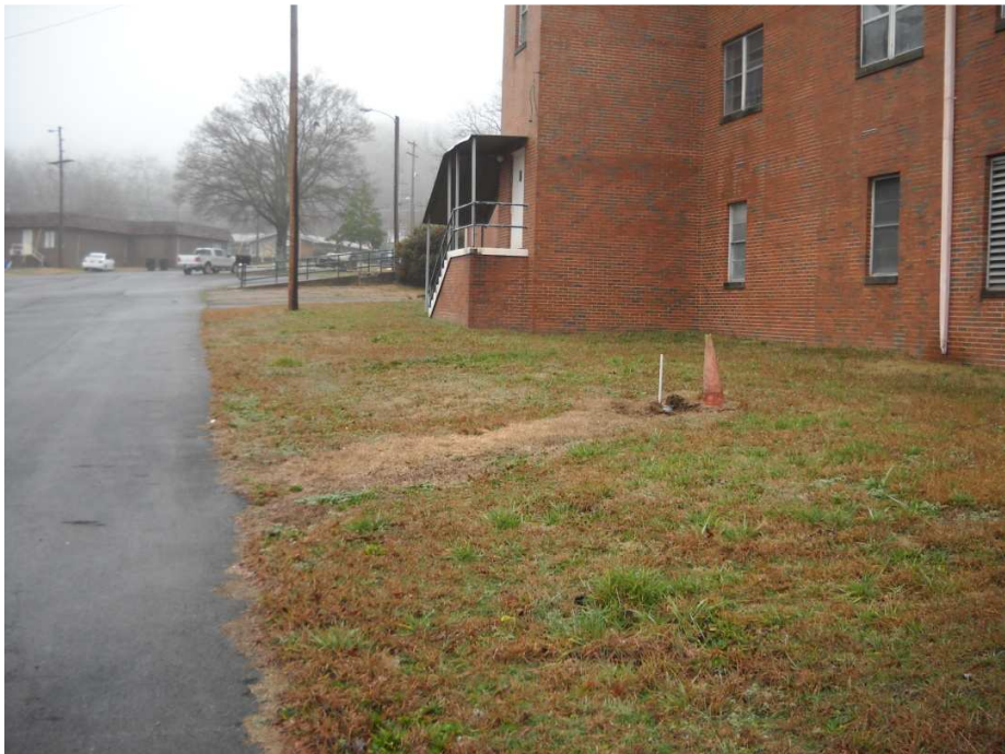
Capped UST pipe and area of dead vegetation from overflow

In December 2011, the site was forwarded to the Assessment Section for additional investigation. In early February 2012, Assessment Section personnel traveled to the site to document current conditions and meet with representatives of the City of Fort Payne. During the time since the initial ADEM response, it appeared that there had been no additional overflows from the UST. During an inspection of the property, ADEM personnel did not observe any other leaking pipes and there did not appear to be any abandoned hazardous wastes on-site. Under the current ADEM administrative code, fuel-oil tanks are exempt from UST regulations. At this time, there are no further actions planned under the AHSCF program.