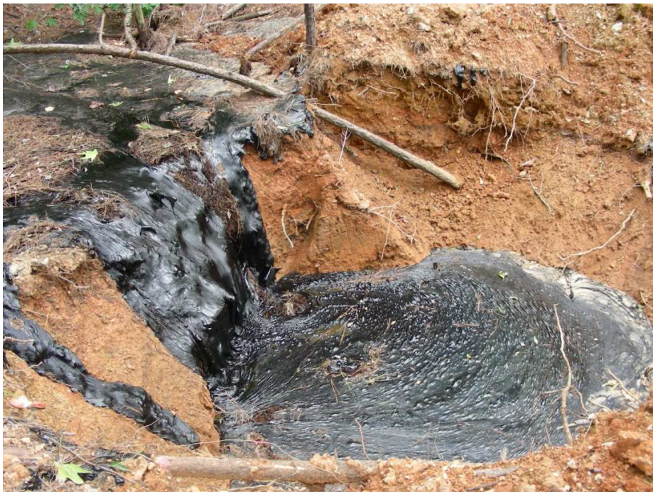
Lagoon runoff collection pit