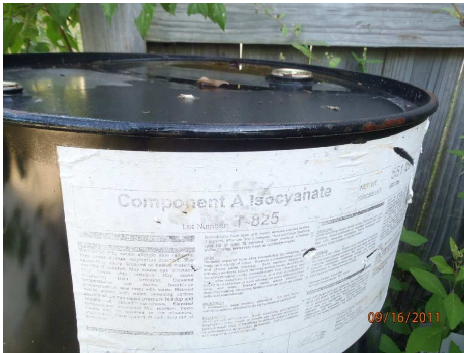
Drum of isocyanate discovered on foreclosed property

The Meadowlark Drum Site is at 422 Meadowlark Place in Alabaster, Shelby County, Alabama. In September 2011, the Assessment Section received a complaint regarding a 55-gallon drum of isocyanate discovered at this site, which is a foreclosed residential property. The complainant represented a company that was contracted to prepare the property for re-sale; this individual was seeking information about how to properly dispose of the drum. Assessment Section personnel contacted the complainant and advised him on drum removal and disposal. Because of the location and amount of waste present, the drum can be classified as “household hazardous waste” and may be disposed of at a municipal solid waste landfill. Assessment Section personnel requested that the complainant provide ADEM with a receipt from the location of disposal. At this time, ADEM is awaiting final documentation from the complainant. Because this site was assessed at the end of Fiscal Year 2011, the final determination is also being reported in the Fiscal Year 2012 Annual Report.