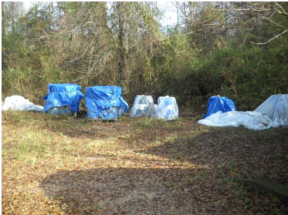
Drums and other containers, secured and staged for removal by EPA