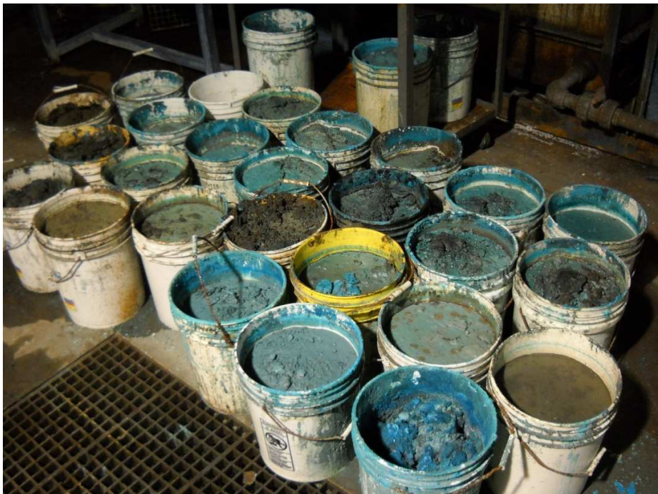
Unsecured 5-gallon buckets of wastewater treatment sludge