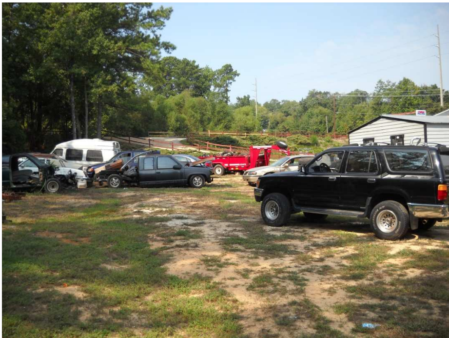
One of several auto repair shops visited during the investigation

In September 2011, Assessment Section personnel traveled to Phenix City to investigate the complaint. Due to a lack of information provided in the complaint, investigators decided to visit all the auto repair shops in the vicinity of Crawford Road. Several repair shops were visited, and contact was made with the owners before conducting a walkthrough of each property. During the inspections, there were no indications of buried drums or other materials, and all of the shops that were generating used oil had retained oil recycling companies to remove their used oil. Because there was a lack of detailed information in the complaint, investigators were unable to find the location of the alleged buried drums. The businesses inspected during the response appeared to be operating within State and Federal guidelines. At this time, there are no further actions planned for this site under AHSCF. Because this site was assessed at the end of Fiscal Year 2011, the final determination is also being reported in the Fiscal Year 2012 Annual Report.