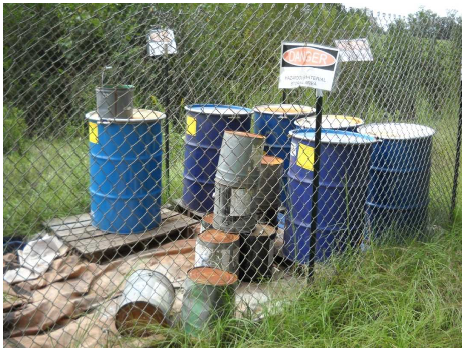
Drums stored along Highway 231 near Corn Creek

In September 2011, Assessment Section personnel traveled to the location of the drums. There were six (6), 55-gallon drums and nine (9), 5-gallon buckets staged in a chain-link fence enclosure. The drums had "hazardous waste" labels attached to them, but there was no information on the labels concerning the type of hazardous materials, time of generation, or information about the generator. Because the drums appeared to be associated with an ALDOT project, the site was referred to the ADEM Compliance and Enforcement Section for further action. The drums were subsequently removed by ALDOT. There is no further action planned for this site under the AHSCF program. Because this site was assessed at the end of Fiscal Year 2011, the final determination is also being reported in the Fiscal Year 2012 Annual Report.