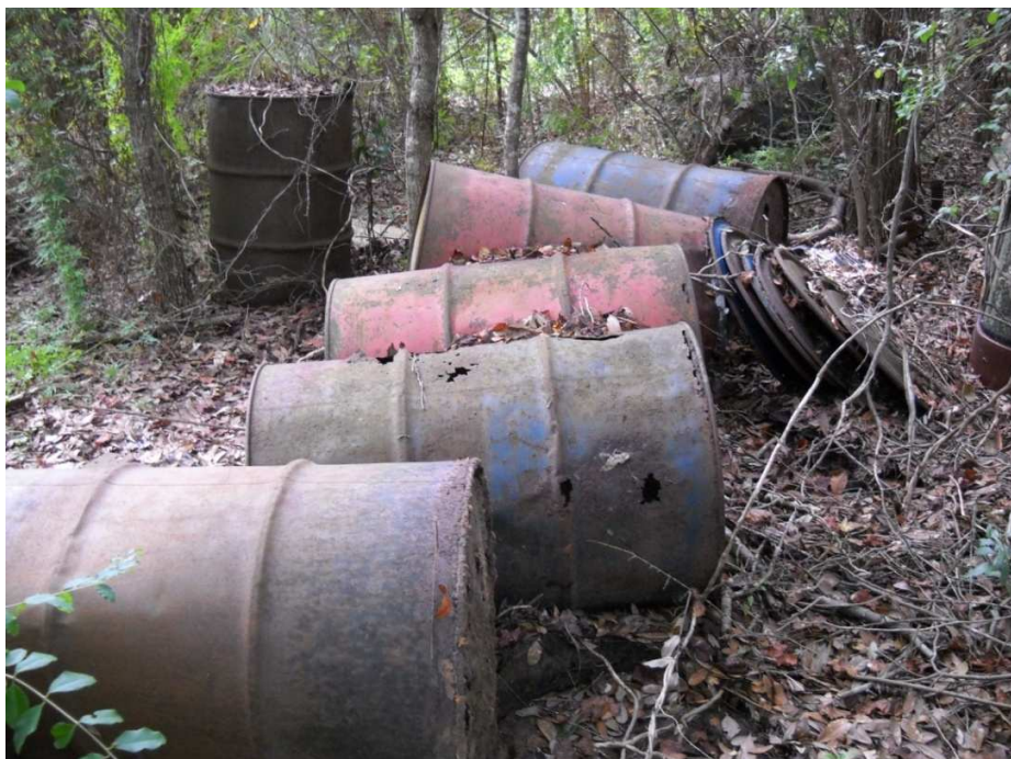
Empty drums found on-site

In September 2011, Assessment Section personnel traveled to the site in response to the complaint. During the inspection, ADEM personnel observed numerous empty 55-gallon drums in a thickly-vegetated area of the property. It was unknown if the drums had leaked out or if they had been brought to the site empty. ADEM investigators discovered that the property was littered with a large quantity of other items such as tires, scrap metal, junk cars, household trash, construction/demolition debris, small fuel tanks, cylindrical tanks, and metal totes. Due to the presence of numerous tires throughout the property, there was a large and aggressive population of mosquitoes in the area, which represented a potential public health risk. Because the drums and metal totes on the property appeared to be empty, there are currently no further actions planned for this site under the AHSCF program. In September 2011, the site was referred to ADEM's Solid Waste Branch for further action. Because this site was assessed at the end of Fiscal Year 2011, the final determination is also being reported in the Fiscal Year 2012 Annual Report.