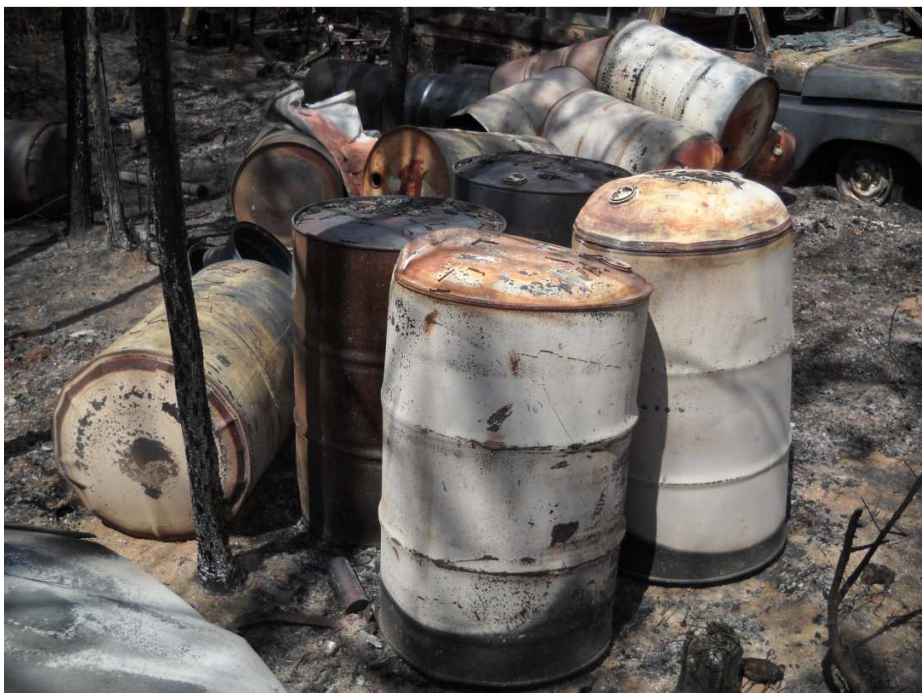
Pressurized, bulging drums found on-site