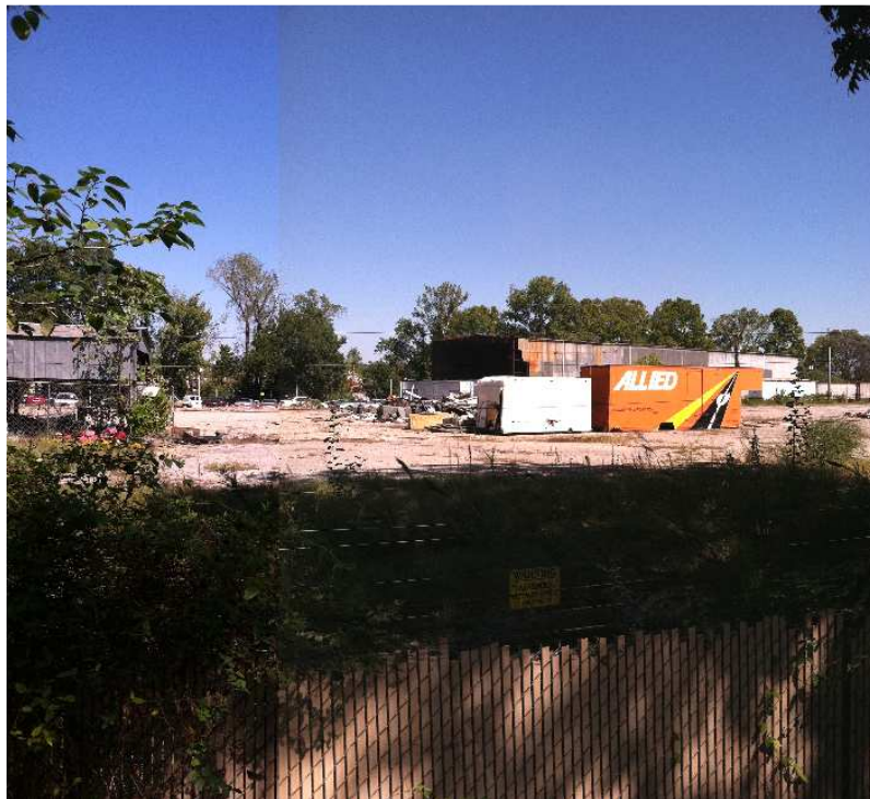
View of site from neighboring property

In early October 2011, Assessment Section personnel traveled to the site to investigate the complaint. Nearby residents were interviewed about the activities taking place on the B&G Auto property and the Reynolds Metals property to the south. There were no apparent witnesses to the alleged drum burials and there were no significant complaints about the business operations on the properties. Investigators met with the owner/operator of B&G Auto, which is an active towing and repossession company. Assessment Section personnel learned that Reynolds Metals is no longer in operation and the owner of B&G Auto is in the process of purchasing the property. The owner of B&G Auto stated that he had previously contracted a mobile crusher to come to the property and crush cars for scrap metal recovery, but this practice was discontinued about four years prior. Assessment Section personnel conducted a walkthrough of both properties and did not observe any containers of hazardous materials or any signs of illegal disposal or burial. ADEM personnel also did not observe any evidence that car-crushing activities had recently occurred on-site. At this time, there are no further actions planned under the AHSCF program.