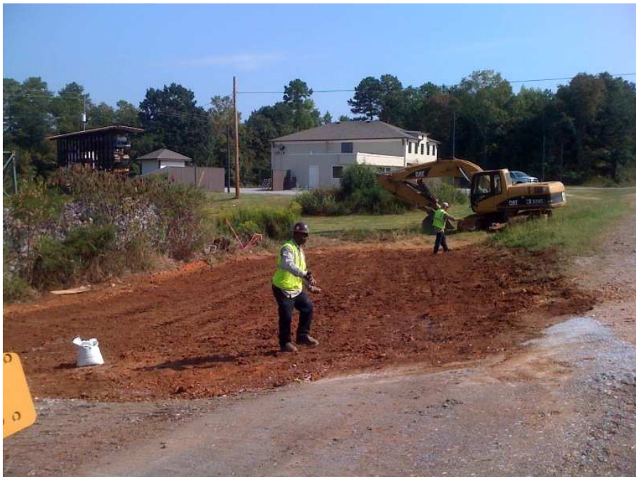
Backfilled excavation area with crew spreading grass seed