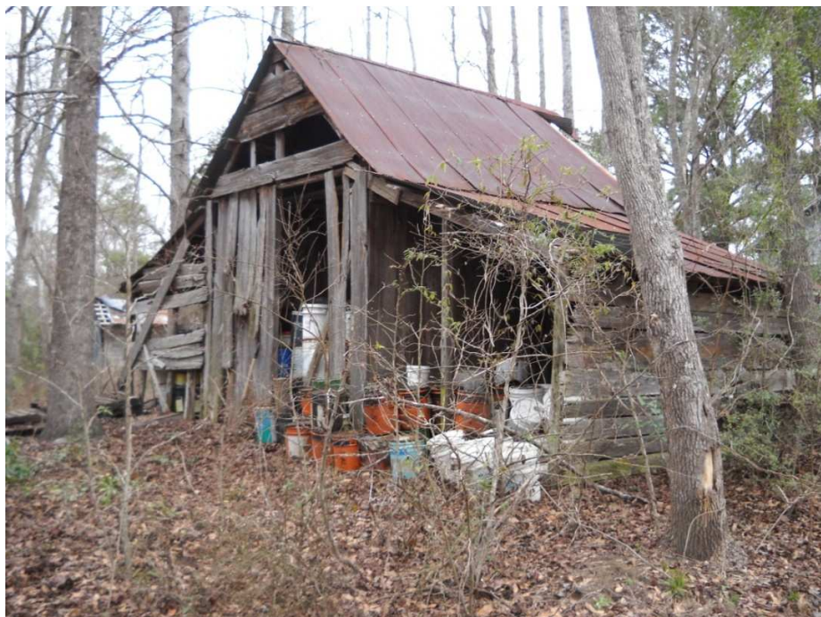
Barn with containers of construction materials

In early February 2012, Assessment Section personnel traveled to the site and met with the lessee of the property. ADEM personnel located the barn, which contained numerous small containers of chemical products used in the construction business. Most of the containers were stored inside the barn or under an awning; however, some containers were stored on pallets outside of the barn. The container labels indicated that the materials were grout liquids, surface retarders, polyurethane sealants, damp-proofing compounds, solvents, and strippers. None of the containers appeared to be leaking at the time of inspection. According to the lessee, the previous tenants had either purchased the products or traded for them. The owner of the products, who works in the construction business, has reportedly been removing them from the property over the last two years. Assessment Section personnel advised the lessee to move the containers stored outside on pallets to the barn to prevent contact with rain. At this time, there are no further actions planned under the AHSCF program.