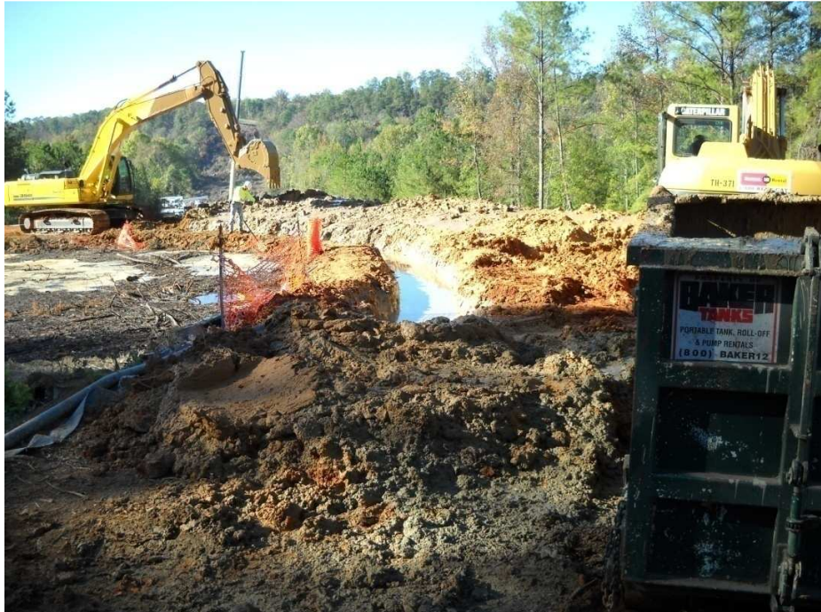
EPA constructing a slurry containment wall around the lagoons