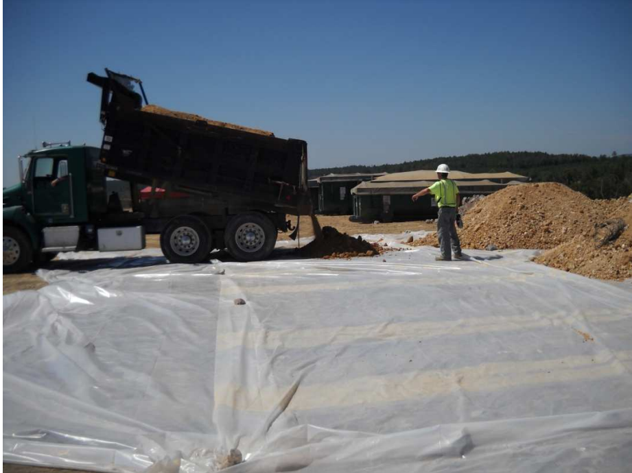
Non-hazardous surface soil removed from right-of-way