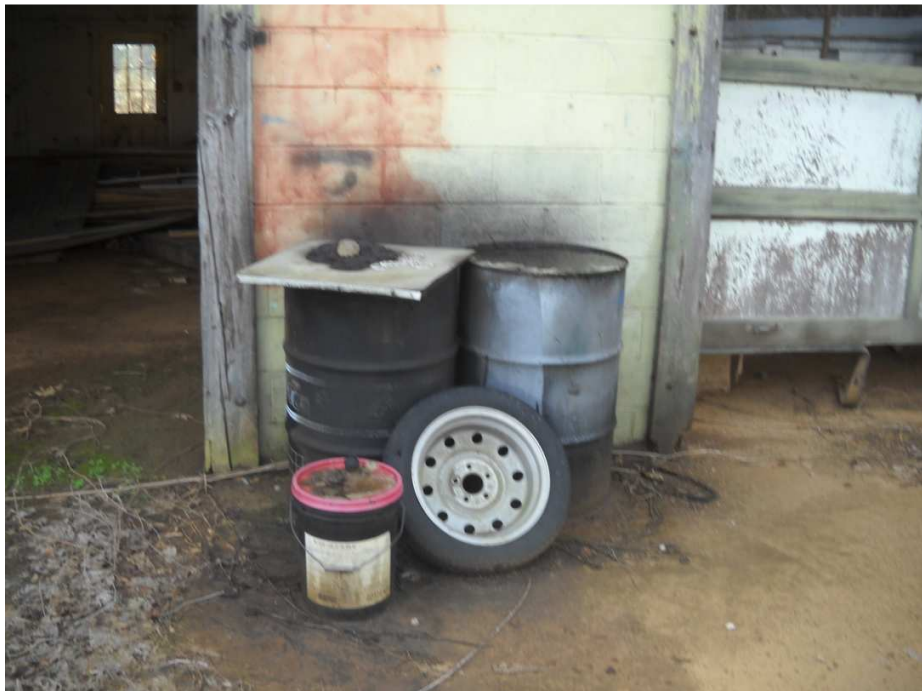
55-gallon drums of unknown material, found near main building

In late February 2012, Assessment Section personnel traveled to the site to inspect the drums and document conditions at the site. After speaking with nearby residents, it was learned that the site was being used to store farm equipment. The main structure on-site appeared to have been used for automobile repair by the previous owner before the company went out of business. In the area around the main building, Assessment Section personnel found the two (2), 55-gallon drums noted in the referral, as well as five (5), 55-gallon drums with unknown contents and several 5-gallon buckets of multi-gear lubricant. Further inspection showed that the five drums were empty. A large pile of household garbage and other refuse was also found on-site. During the investigation, ADEM personnel noted two small metal pipes protruding from the ground near the main service structure; it was thought that these might be associated with a UST. The current owner stated that the drums were present when he had purchased the property five years prior; he did not know the function of the underground pipes. The owner is in the process of having the contents of the two drums tested for removal. The site was referred to ADEM's UST Compliance Unit and UST Corrective Action Section for further investigation. At this time, there are no further actions planned under the AHSCF program.