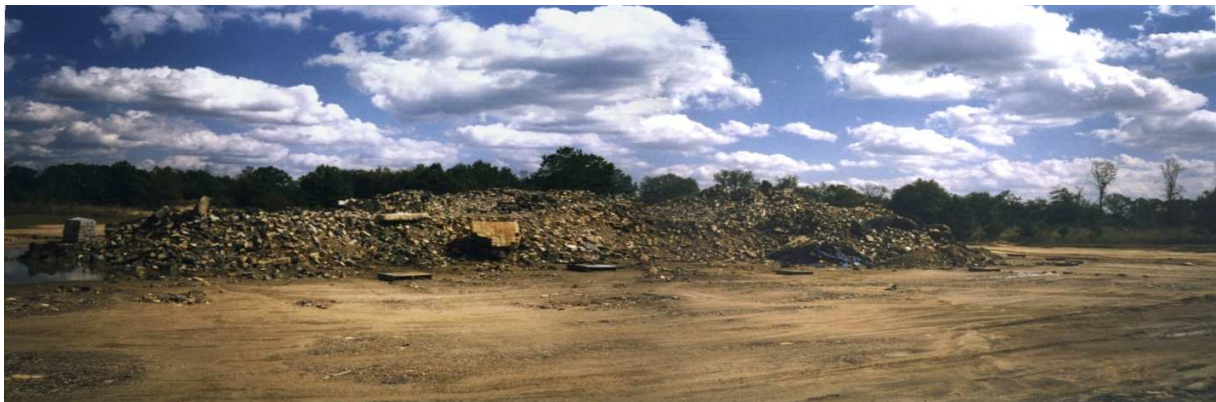
Foundry brick staged for removal

EPA began invoicing ADEM in 2009 for $100,000 per year for five years to pay the required State match. In 2014, EPA will invoice ADEM for the remaining portion of the cost. ADEM will pay the State's share of remediation costs through the Alabama Hazardous Substance Cleanup Fund.