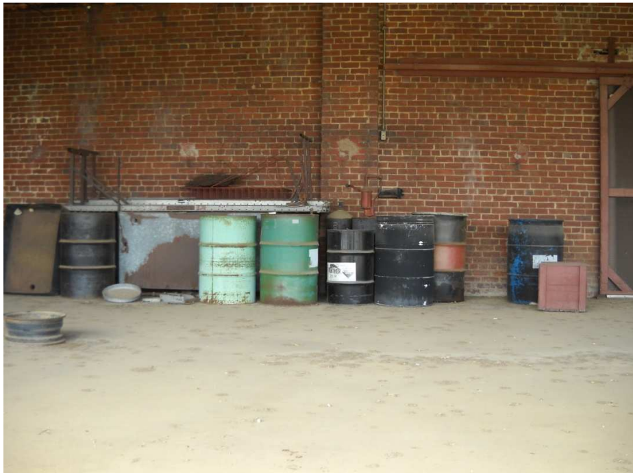
Drums and containers staged on loading dock of old building

In August 2012, Assessment Section personnel traveled to the site to evaluate the drums and document conditions on the property. During the investigation, ADEM personnel observed several drums and other containers staged on the loading dock of an older brick structure at the corner of Moore Avenue and 12 th Street. There were eight (8), 55-gallon drums, four of which contained unknown liquids. Two of the drums were missing bung caps, and a faint petroleum odor was detected in their vicinity. ADEM personnel also observed one (1), 35-gallon drum, one (1), 5-gallon bucket, and one acetylene gas cylinder. The 35-gallon drum was empty and had a caustics placard affixed to it. Assessment Section personnel acquired tax information for the property and located the owner. In September 2012, the owner had the contents of the drums tested, showing that they contained honing oil, diesel fuel, mineral spirits, and caustic cleaning solution. In October 2012, the drums were removed from the site and taken to an appropriate disposal facility. At this time, there are no further actions planned under the AHSCF program.