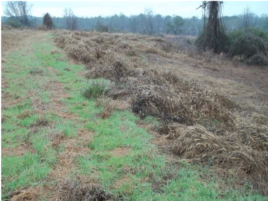
Area where petroleum-contaminated water was reportedly dumped

In January 2012, Assessment Section and Industrial Hazardous Waste Compliance and Enforcement Section personnel traveled to the site to meet with the complainant and conduct an inspection of the dumping area. During the inspection, ADEM personnel did not observe any evidence that illegal dumping had occurred. There were no detectable odors, soil staining, or distressed vegetation in the area. Following the on-site inspection, ADEM personnel traveled to Jasper, Alabama to speak with representatives of the petroleum company implicated in the complaint. The company provided the ADEM inspectors with copies of invoices where maintenance was performed on the station pumps and documentation that water had been pumped from the sumps and appropriately disposed of at a fuel blender. At this time, there are no further actions planned under the AHSCF program.