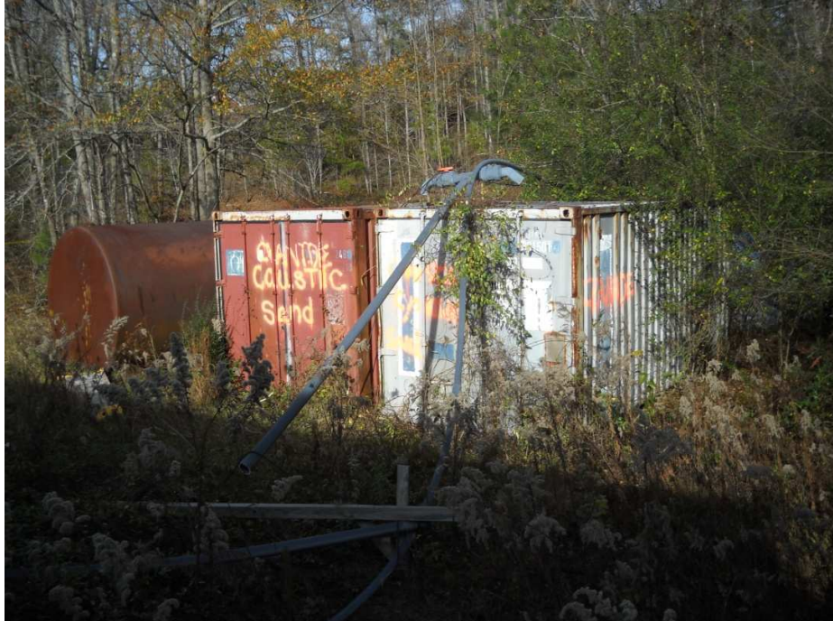
Conex boxes and large AST containing potentially-hazardous sands