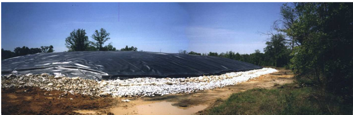
Brass foundry waste staged for removal