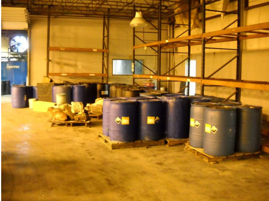
Drums of hazardous wastes abandoned on-site