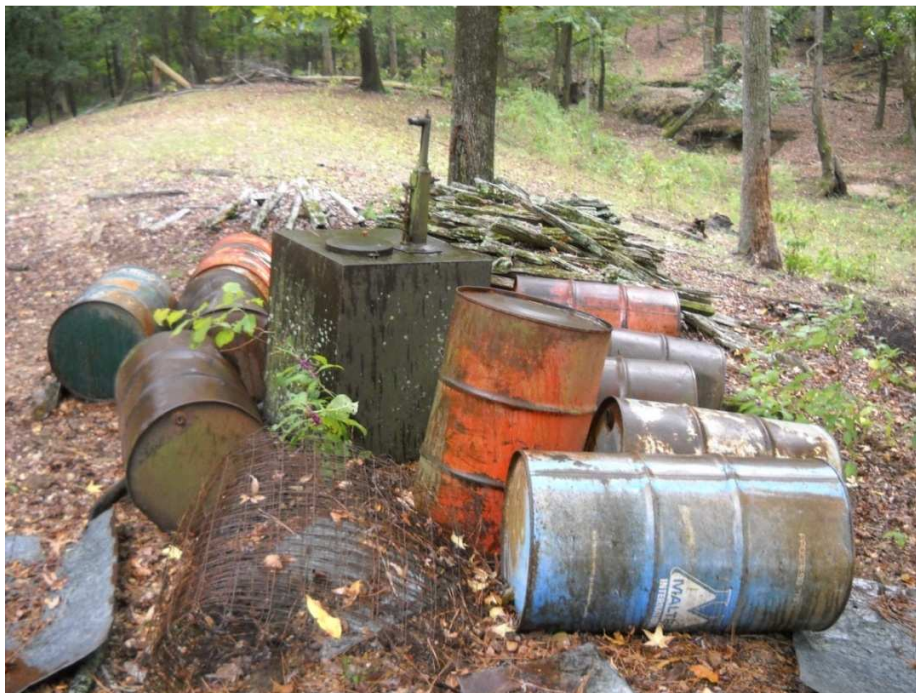
Empty fuel drums and pumping station found near creek

In September 2011, Assessment Section personnel traveled to the area to search for the drums. Investigators entered a wooded area west of County Road 373 and walked the length of the creek. Several empty 55-gallon drums were discovered in various locations along the creek; all were intact and did not appear to have leaked their contents. In a clearing along the creek, investigators found a large group of empty drums near a field pumping station. It appeared that the drums had originally contained fuel for operating farm equipment and that some of the drums had rolled or washed down into the creek bottom. There was no evidence that hazardous substances had leaked into the creek. At this time, there are no further actions planned for this site under the AHSCF program. Because this site was assessed at the end of Fiscal Year 2011, the final determination is also being reported in the Fiscal Year 2012 Annual Report.