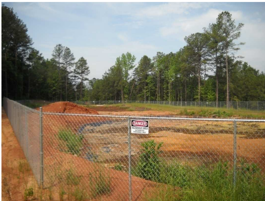
Completed slurry containment wall and enclosure