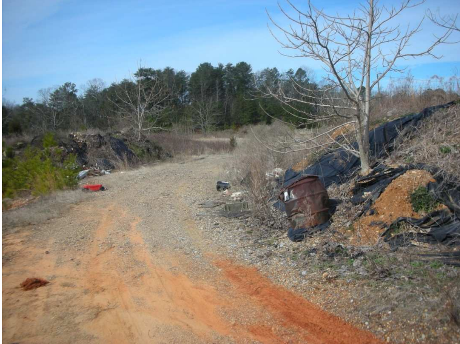
Piles of potentially oil-contaminated soil, covered with plastic