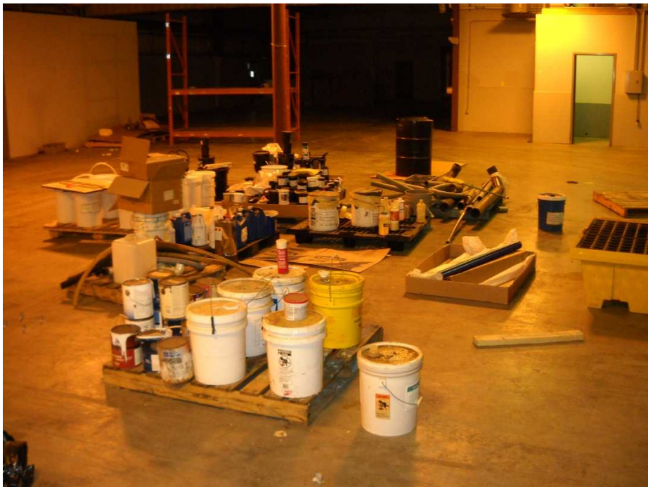
Small containers of hazardous chemical products and wastes