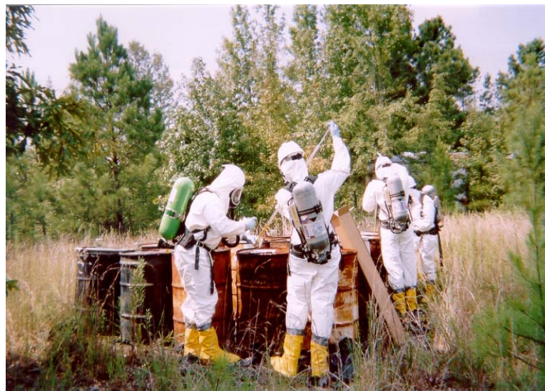
HAZ Mat Team Sampling Drums, McCullough Oil, Chilton County

The McCullough Oil Recycler site is located at 145 County Road 523, in Chilton County, approximately 4.5 miles east of Verbena, Alabama. The