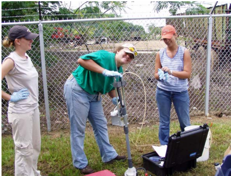
Groundwater Sampling Utilizing Manual Bladder Pump Montgomery Brownfield, Montgomery, AL

The City administration is concerned with the appearance of the sites and the potential for the sites to directly impact local residents and tourists by direct contact with potentially contaminated surface soils. To help identify these concerns, the City of Montgomery obtained a Pilot Brownfield Grant from the EPA. Brownfield assessments are performed at sites where there is a real or perceived threat that previous activity at a site may have left behind industrial materials that could pose a problem for reuse of the site. This baseline environmental assessment provides the data needed to plan for redevelopment of this area. The City entered into a Memorandum of Understanding with ADEM to have the Department perform the property assessments of proposed redevelopment sites. This site was initiated prior to the establishment of new funding tracking codes. As a result, this site was and continues to be tracked utilizing the AHSCF fund code.