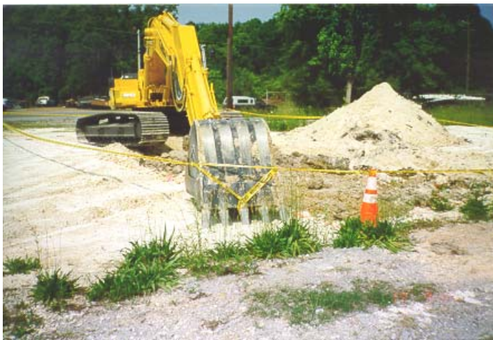
Excavation activities at Glencoe Battery Company Etowah County

Glencoe Battery Company is located at 219 West Main Street in an urban area surrounded by businesses and residences. This 0.2 acre site began cracking batteries in approximately 1950. The contaminant of concern is lead, and the areas of concern are lead-contaminated soils with a potential to impact groundwater.