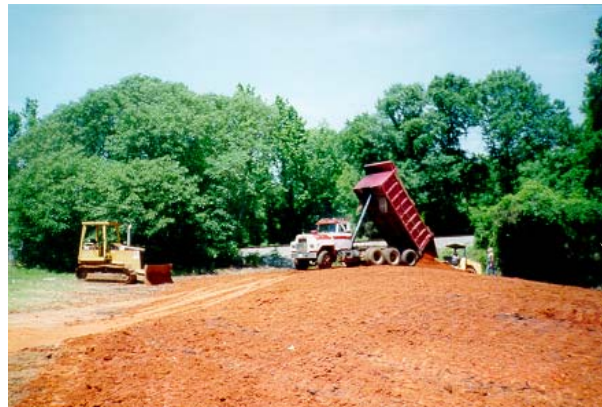
Backfilling of areas where contaminated soil was removed – Phillies Cigar, Dallas County