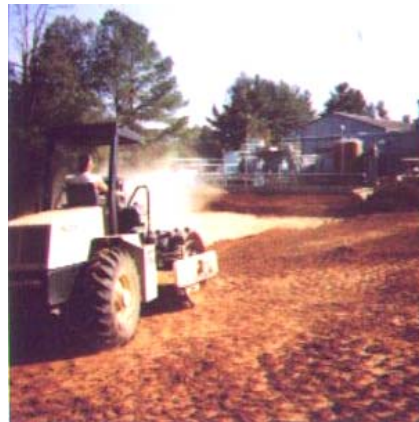
Excavation and removal activities at Hall Chemical Company – Marshall County

the potential for detrimental groundwater impacts. These activities also protect surface waters.