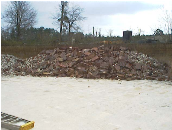
Auburn Southside Waste Treatment Plant Lee County