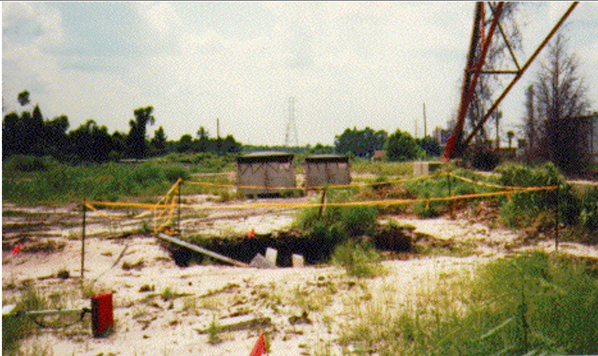
Buchanan Lumber Company, Mobile, Alabama