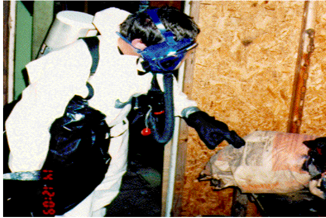
Inspecting Waste, Montgomery Plating Montgomery, Alabama

Phase II cleanup activities will include disposal of staged materials and cleanup of the building interior and vats. The AHSCF provided funding for a qualified contractor to perform Phase I activities and to determine Phase II activities. The AHSCF also provided funding for staff to evaluate the initial threat to public health and the environment, to provide for oversight during the ongoing cleanup process, and to collect/analyze samples of the contaminated soil in the areas of concern. It is anticipated that ADEM will recommend further cleanup of the site at the federal level.