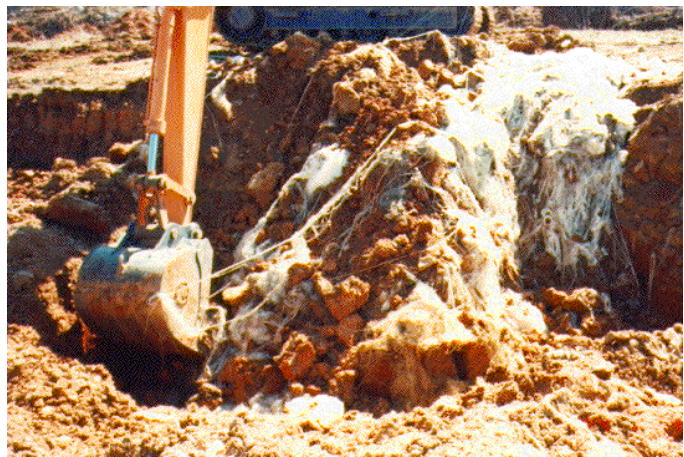
Monitoring well installation and excavation at Goodyear, Scottsboro, Jackson County, Alabama