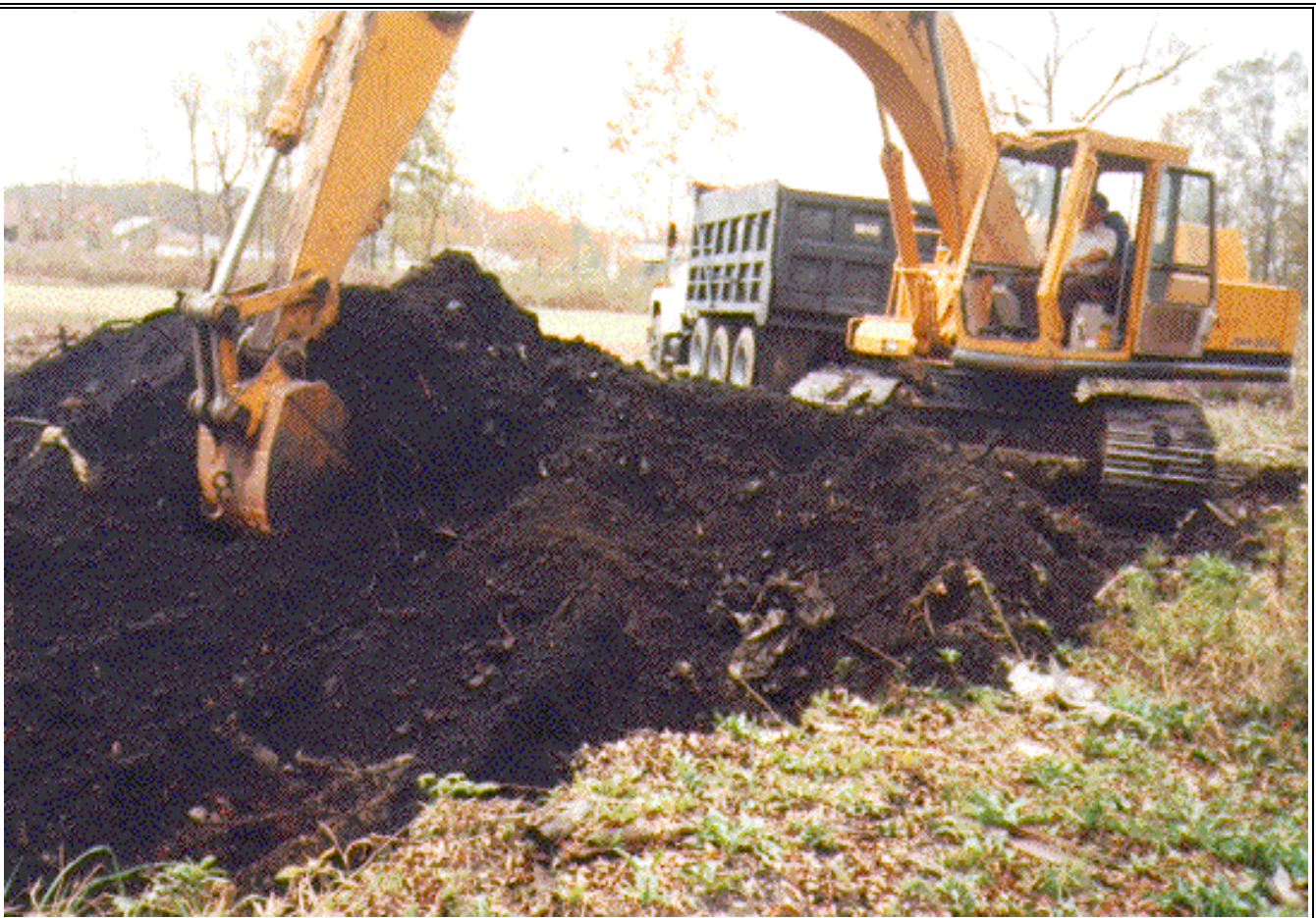
Scott Junkyard excavation, Brewton, Escambia County, Alabama