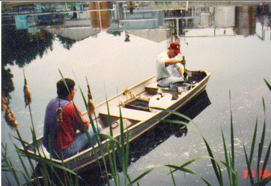
Field Operations Personnel Performing Water and Sediment Sampling at Hall Chemical, Arab, Marshall County, Alabama