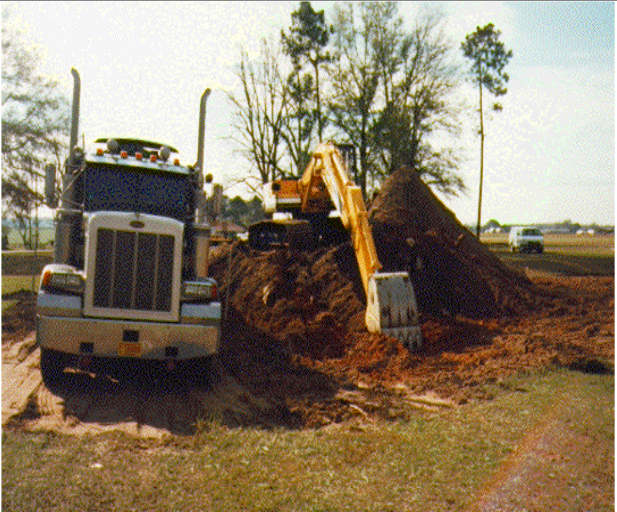
Atmore Aluminum Waste Pile, Atmore, Escambia County, Alabama