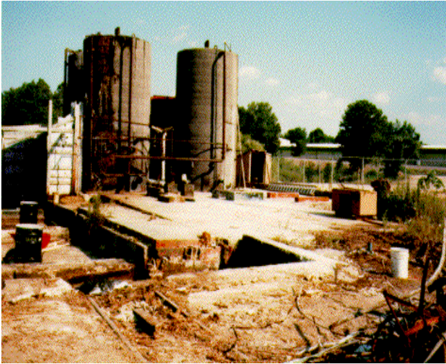
Fullco Lumber Company tanks prior to removal by EPA ERRB

Emergency Response and Removal Branch (ERRB) of the U.S. Environmental Protection Agency (EPA) was sent to further investigate the site. After limited expenditure of AHSCF funds to fence the former processing area, the EPA initiated an excavation and cleanup of the site -- which is still ongoing. Cost for the State to erect a fence at this site was approximately $11,000.00. Currently the EPA has spent approximately $500,000.00 in their cleanup efforts. Total cost for this cleanup could well exceed $1 million.