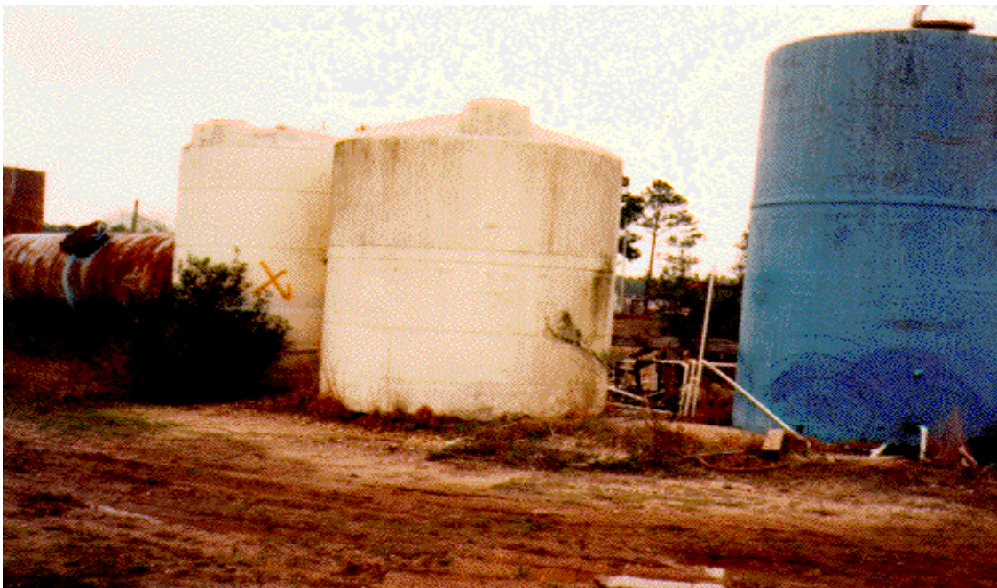
Caren Inc., tanks, Gulf Shores, Baldwin County, Alabama

The former Caren Inc., a former sludge treatment facility, is located in the City of Gulf Shores, Alabama. When the site was abandoned, 4 large tanks were left on the property by the former owner. A large amount of a sludge conditioner used in the former operations was left in the tanks. After the initial investigation, a qualified disposal firm was contracted to disassemble the tanks and the sludge conditioner was properly disposed of at the Timberland Landfill in Brewton, Alabama.