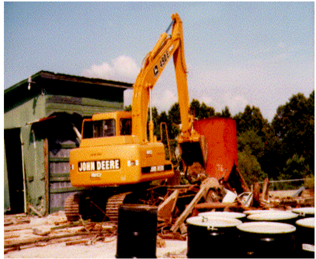
Initial excavation and removal efforts at Fullco Lumber Company, Haleyville, Marion County