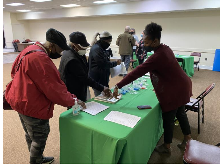
ADEM's most recent public availability session was held on January 27 in Uniontown

ADEM has scheduled another public availability session and public hearing for April 14 in Uniontown related to the proposed permits.